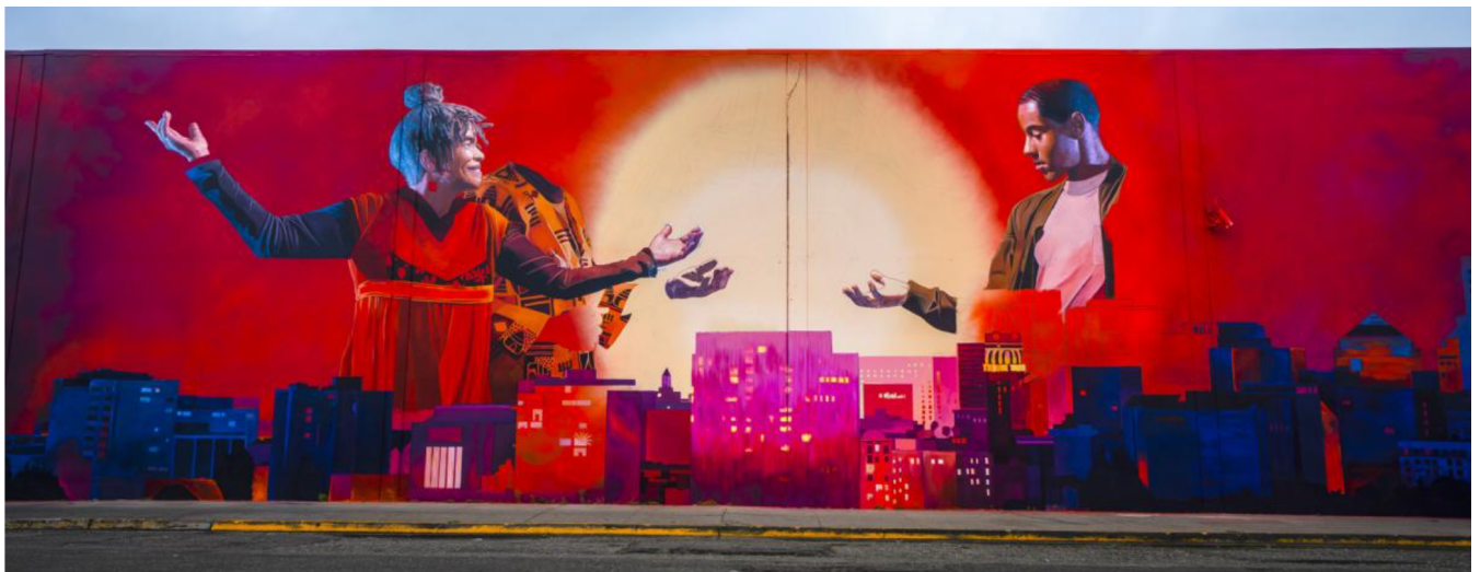
Title: "Love Letter To Oakland"