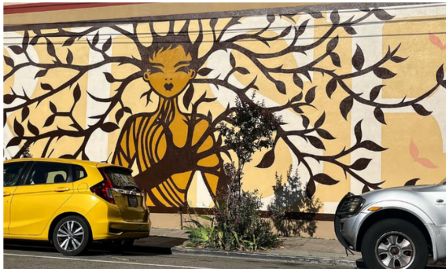
Artist: Unknown Location: Shattuck Ave. at 46th St.