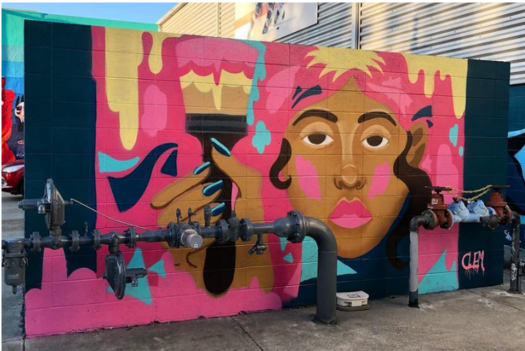
Artist: a young artist with @graffiticampforgirls Location: San Pablo Ave. at 17th St.

COVID-19, what is needed from a post-pandemic recovery, and how to center racial equity in policy formation and resource distribution. FVLC's Policy Department was in attendance and engaged meaningfully with participants, raising the needs and concerns of GBV survivors.