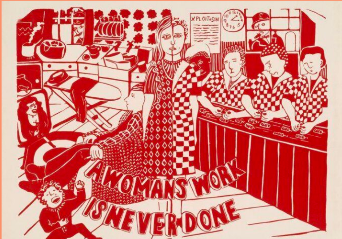
Art from the Red Women's Poster Collective

The Quarterly Newsletter of the Family Violence Law Center's Policy Department