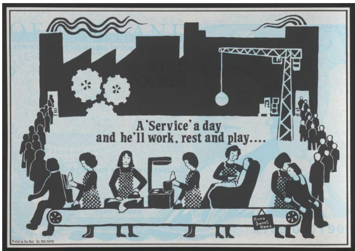
More Art from the Red Women's Poster Collective