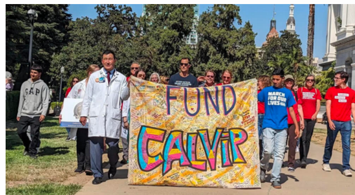
FVLC Policy Department marches in Sacramento in support of Ab28, which is the Gun Violence Prevention and School Safety Act

Oakland Police Chief Search: In Oakland, there have been multiple community engagement events to ask the public what they are looking for in the new Chief of Police, during which community members raised concerns about police harassment, negligence, and the rise in crimes involving gun violence and home robberies. FVLC's policy team attended to share our expert knowledge around gender-based violence, and what this means in our pursuit for a new Chief. We conveyed that oftentimes, domestic violence, intimate partner abuse, sexual assault, rape, sex trafficking and other forms of gender-based violence are not seen as legitimate social issues of concern but are often subordinated or attached to other problems, and requested that the new Chief undergo the education and training on the devastating impacts of gender-based violence in our families and communities.