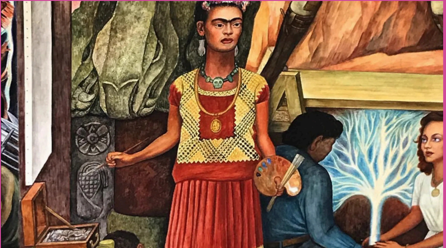
Portrait of Frida Kahlo was painted by Diego Rivera

The Quarterly Newsletter of the Family Violence Law Center's Policy Department